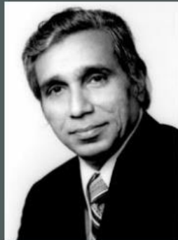
Fazlur Rahman Khan